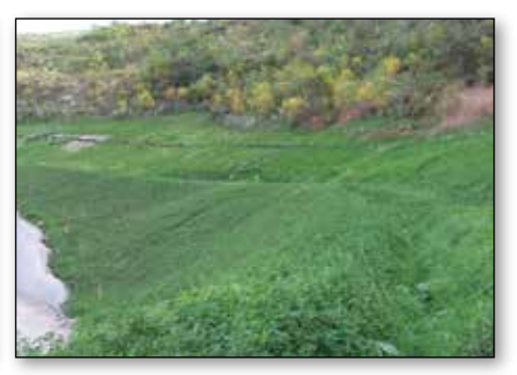
Luxurious growth in just two months