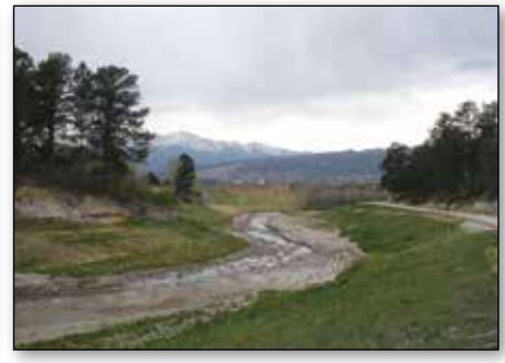
One year later with vegetation emerging