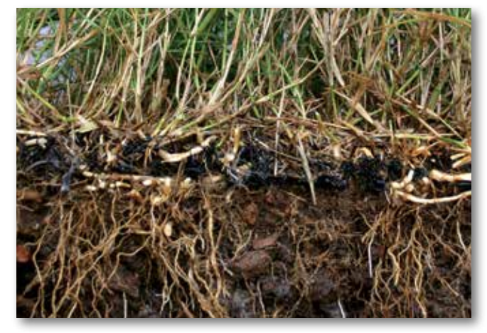
Roots anchored within Futerra TRM matrix

Designed to provide permanent erosion control, Futerra® TRMs foster more rapid and complete vegetation establishment to accommodate higher levels of flow resistance versus conventional Turf Reinforcement Mats. The key is its open, three-dimensional matrix that delivers: