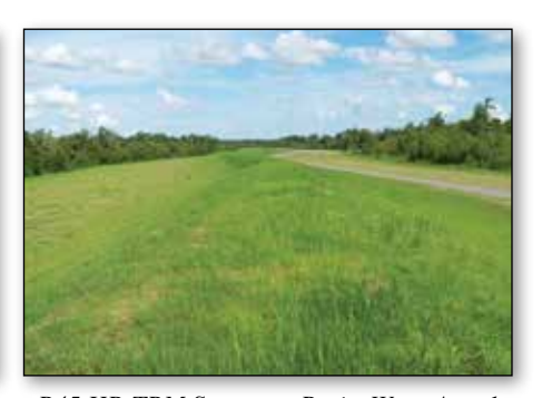
R45 HP-TRM System to Resist Wave Attack

Profile® can provide additional TRM options to accommodate site conditions, including thermally fused geotextile fabric backings and lower cost polypropylene structures.