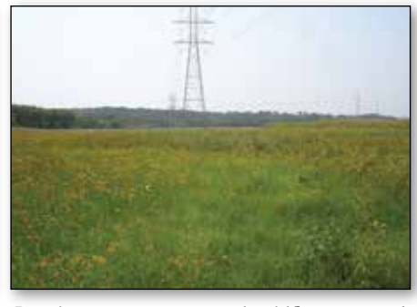
Flexterra®HP-FGM™ applied into TRM 7003 Resulting native grass and wildflower growth