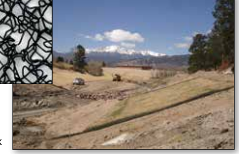
Streambank reconstruction on semi-arid site